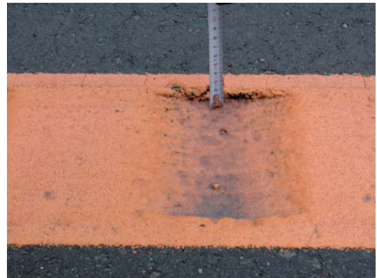
Photo 2-8: Rumble strip at a no-passing single-yellow centerline section (close-up)