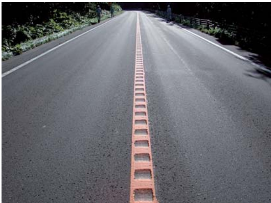
Photo 2-7: Rumble strip at a no-passing single-yellow centerline section