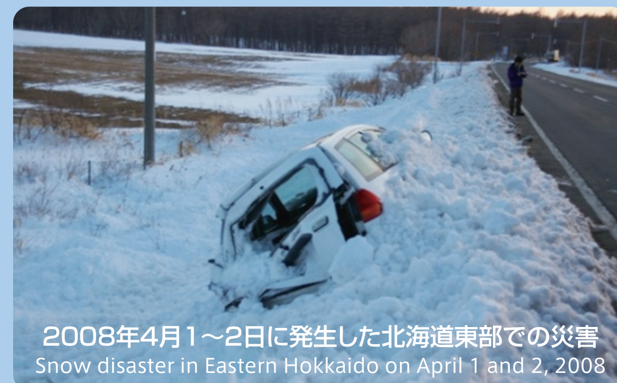
2008年4月1～2日に発生した北海道東部での災害 Snow disaster in Eastern Hokkaido on April 1 and 2, 2008

Global warming is forecasted to drastically alter snowfall and temperature trends in Japan. The cold, snowy regions of this country are expected to have winters with unprecedented changes, such as warm winters with little snowfall, heavy snowfall in areas that have typically had little snowfall, and localized intense snowfall. This study surveys the trends in the snow and ice environments for recent years.