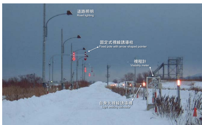
▲ 試験道路直線部の道路付属施設設置状況 Road facilities installed along the straight section

The following experiment and observation facilities are at the field. - Weather station (anemometer, precipitation meter, visibility meter, snow depth meter) - ITV camera - Road lighting - Time lapse video recorder - Road information board - Light-emitting delineator - Fixed pole with arrow-shaped pointer